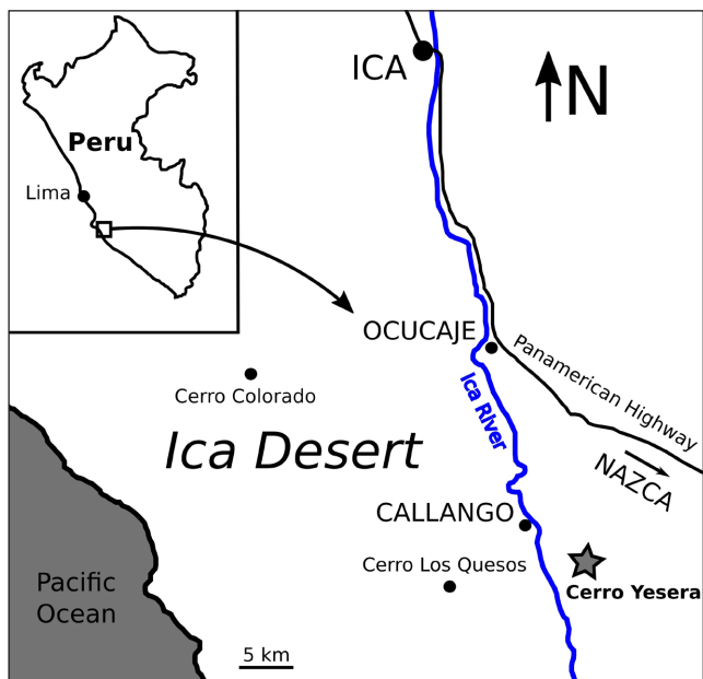
Fig. 1 - Map of the Ica Desert indicating the site of Cerro Yesera c. 8 km south-east to the locality of Callango, southern coast of Peru, where the fossil shark specimen CPI-7899 was discovered. The location of Cerro Colorado and Cerro Los Quesos, two highly fossiliferous sites of the Pisco Formation, is also reported.

Aguilera & Aguilera 2004; Lambert & Gigase 2007; Ehret et al. 2009b; Takakuwa, 2014), coprolites (e.g., Diedrich & Felker 2012; Stringer & King 2012), and stomach contents (e.g., Shimada 1997a; Fanti et al. 2016). Such occurrences, coupled with morphological observations on fossil shark teeth, contribute to depict the ecotrophic habits and preferences of ancient shark taxa. Fossil stomach contents, in particular, often provide the most accurate glimpse into the diet of fossil vertebrates, since both the predator (or scavenger) and prey (or scavenged) taxa can usually be identified (Cicimurri & Everhart 2001).